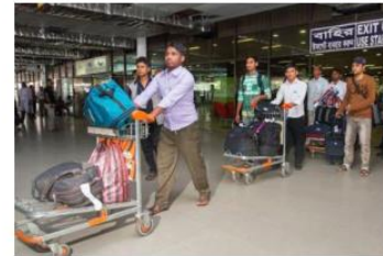
Manpower Clearance Assistance