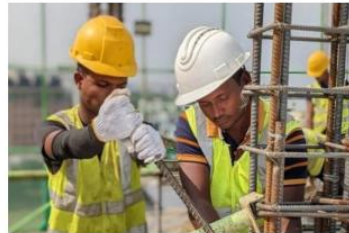
Local Manpower Solutions