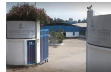
Training & Development