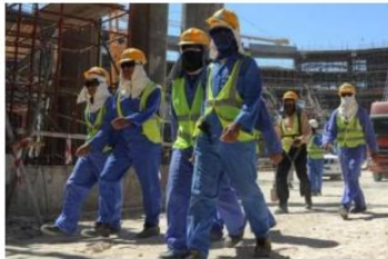
Overseas Recruitment Solutions