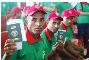
Visa Assistance & Ticketing